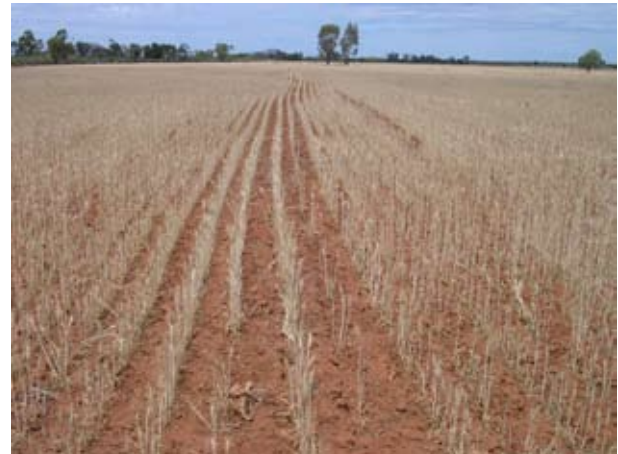
Good top soil structure resulting from practising conservation farming