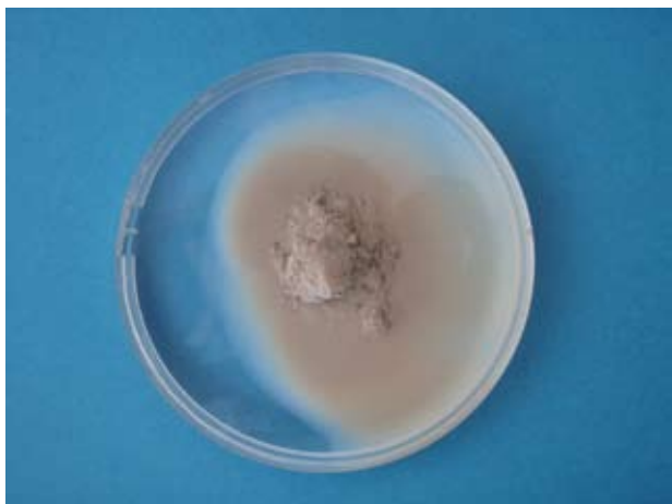
Dispersive soil in water

Dispersion causes soil micro-aggregates to collapse into individual soil particles: sand, silt and clay.