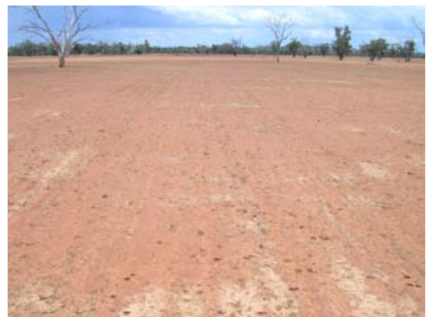
Poor top soil structure caused by multiple tillage