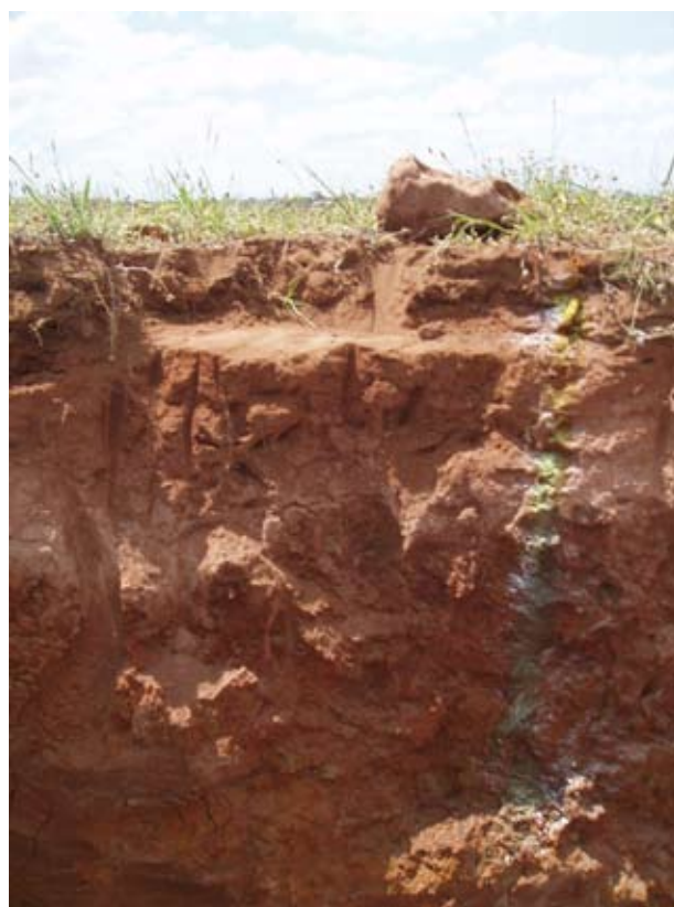
Soil pit showing a hardpan

Digging a hole or pit and examining the soil profile is a reliable way of finding hardpans.