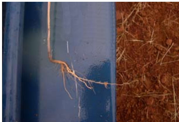
Root distortion due to a hard pan